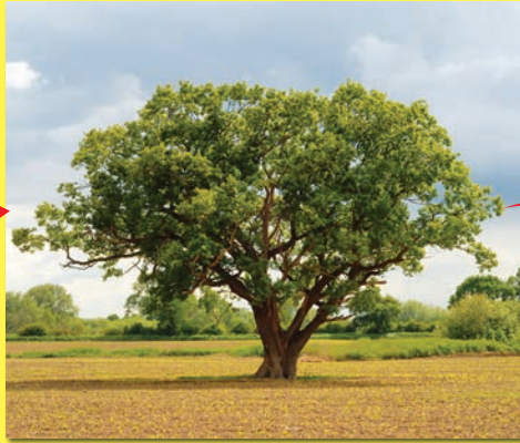
An oak tree may live for hundreds of years.

This is the story of an oak tree's life cycle.