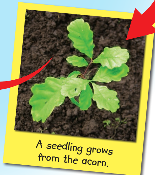
A seedling grows from the acorn.